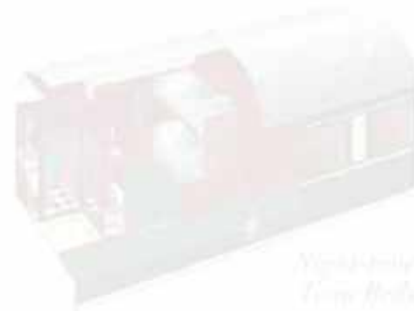
Side by side Twin